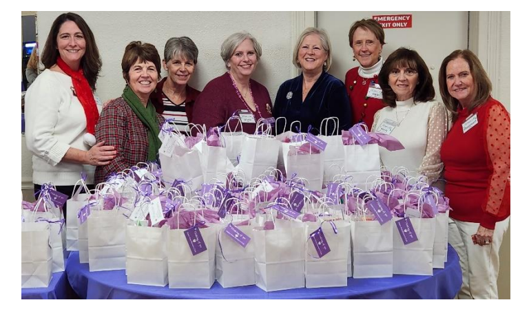
Caregivers Cookie Committee Members