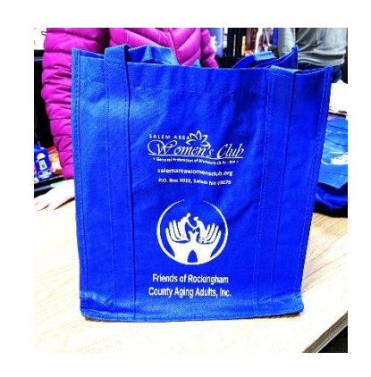
Arts and Culture